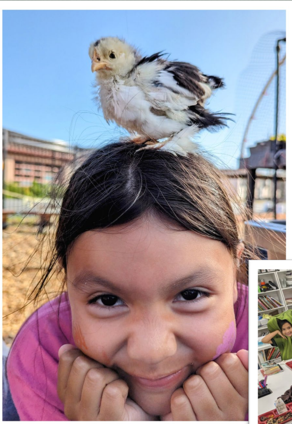
Starlight Elementary (Watsonville, CA)