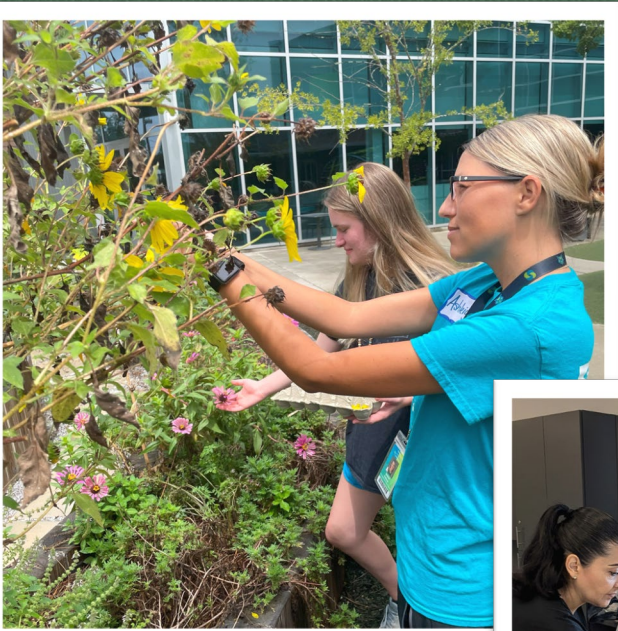
Dr. John Ochsner Discovery Health Sciences Academy (New Orleans, LA)