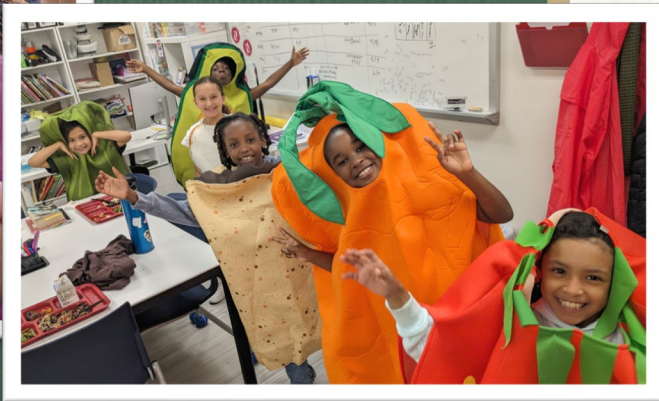
DC Bilingual Public Charter School (Washington, D.C.)