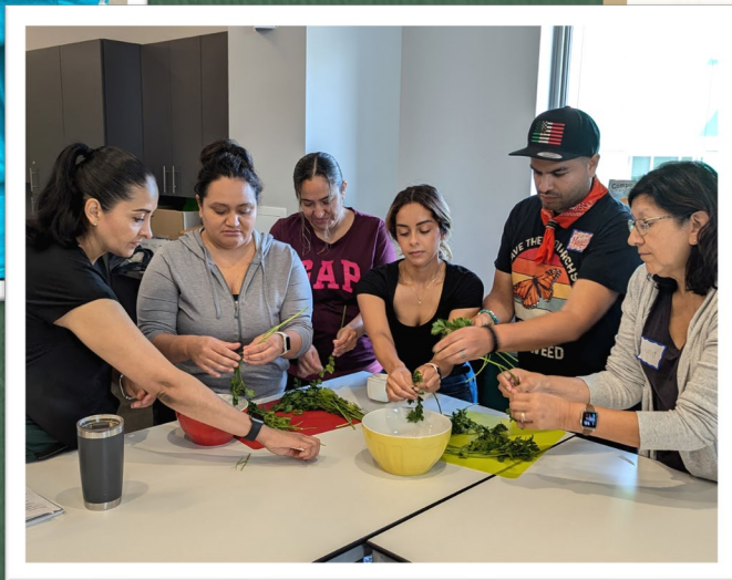
Academy for Global Citizenship (Chicago, IL)