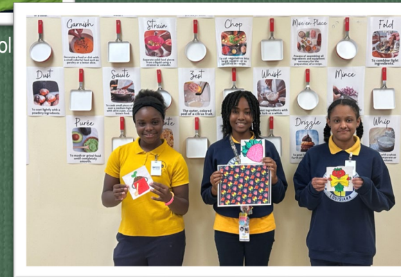
Belle Chasse Academy (Belle Chasse, LA)