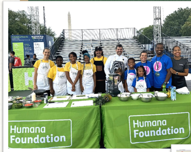
Baltimore Montessori Public Charter School (Baltimore, MD) DC Bilingual Public Charter School (Washington, D.C.)

Our program highlighted the link between food education and creativity through a student artwork contest. Students from Belle Chasse Academy showcased their talents, with winning designs featured on silk scarves and ties given to guests at Carnivale du Vin, our signature fundraising event in New Orleans.