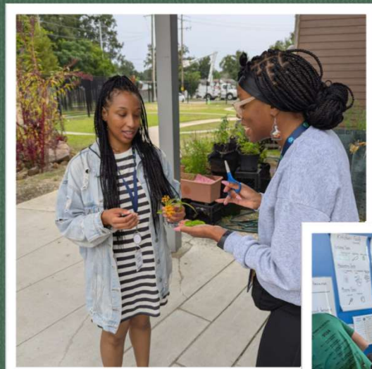
Dr. John Ochsner Discovery Health Sciences Academy (New Orleans, LA)