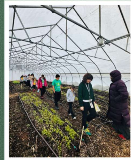
Academy for Global Citizenship (Chicago, IL)