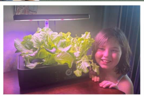
Dr. John Ochsner Discovery Health Sciences Academy (New Orleans, LA)