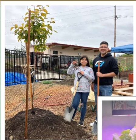
Starlight Elementary School (Watsonville, CA)