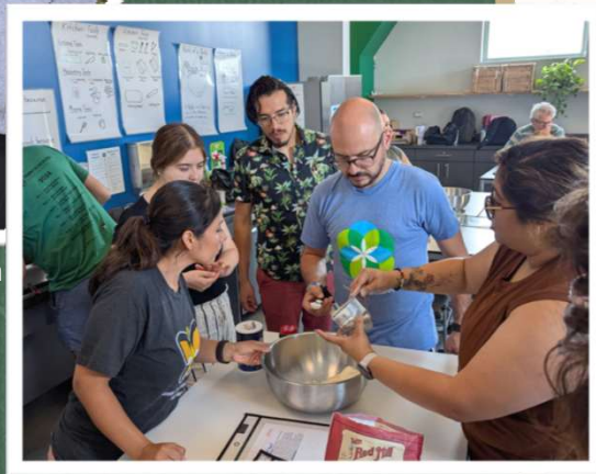
Academy for Global Citizenship (Chicago, IL)