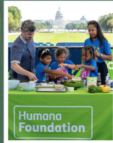
Baltimore Montessori Public Charter School (Baltimore, MD) & DC Bilingual Public Charter School (Washington, D.C.)