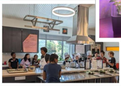
Cunningham Elementary School (Austin, TX)